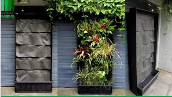
TIMBER FRAMED GARDENS

This system is a light weight method of installing vertical gardens where no penetration of substrates is permitted and where freestanding vertical gardens and space dividers are required.