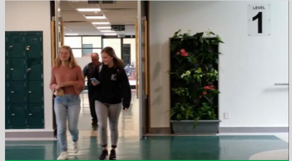
EXAMPLE - INTERIOR

Hanging Gardens is considered to be at the forefront of vertical garden and green technology innovation. Our gardens are designed to be long-lasting, sustainable and highly resilient to seasonal climate changes. Throughout the process, our professional, friendly team will provide you with a truly personalised service.