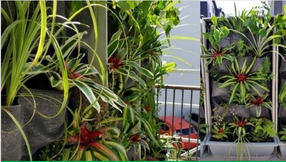
EXAMPLE - EXTERIOR

Hanging Gardens is considered to be at the forefront of vertical garden and green technology innovation. Our gardens are designed to be long-lasting, sustainable and highly resilient to seasonal climate changes. Throughout the process, our professional, friendly team will provide you with a truly personalised service.