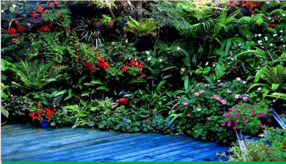
EXAMPLE - EXTERIOR

Hanging Gardens is considered to be at the forefront of vertical garden and green technology innovation. Our gardens are designed to be long-lasting, sustainable and highly resilient to seasonal climate changes. Throughout the process, our professional, friendly team will provide you with a truly personalised service.