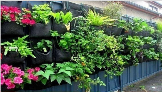
EXAMPLE - RESIDENTIAL

We work alongside our clients to design and customise each Hanging Garden to make the best of the site features. We can assist with all aspects of the design of gardens to beautify residential developments, homes and buildings to improve the urban environment.