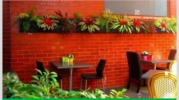
EXAMPLE - INTERIOR

Hanging Gardens is considered to be at the forefront of vertical garden and green technology innovation. Our gardens are designed to be long-lasting, sustainable and highly resilient to seasonal climate changes. Throughout the process, our professional, friendly team will provide you with a truly personalised service.