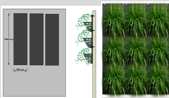
STANDARD SIZES - VERTICALS

The modular nature of this system allows for the creation of gardens of any dimensions. Each Horizontal garden is 900 mm wide and 400 mm high. When layered, these are overlapped both vertically and horizontally by approximately 100 mm to 150 mm.