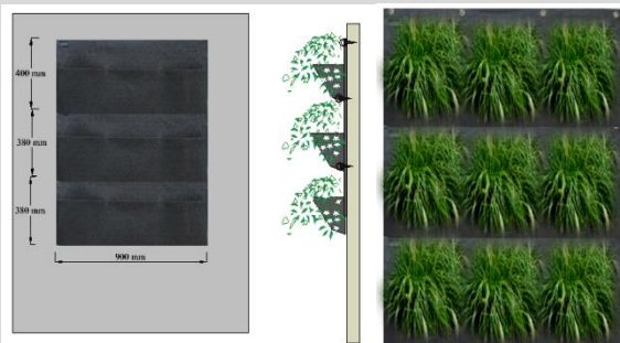
STANDARD SIZES - HORIZONTALS

The modular nature of this system allows for the creation of gardens of any dimensions. Each Horizontal garden is 900 mm wide and 400 mm high. When layered, these are overlapped both vertically and horizontally by approximately 100 mm to 150 mm.