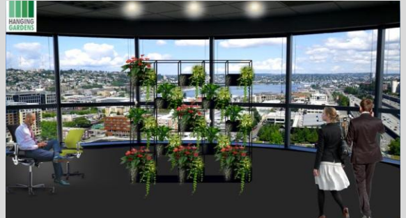
EXAMPLE - BLACK

Hanging Gardens is considered to be at the forefront of vertical garden and green technology innovation. Our gardens are designed to be long-lasting, sustainable and highly resilient to seasonal climate changes. Throughout the process, our professional, friendly team will provide you with a truly personalised service.