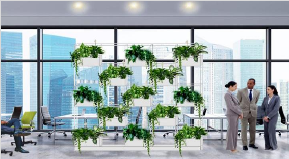
EXAMPLE - WHITE

Hanging Gardens is considered to be at the forefront of vertical garden and green technology innovation. Our gardens are designed to be long-lasting, sustainable and highly resilient to seasonal climate changes. Throughout the process, our professional, friendly team will provide you with a truly personalised service.